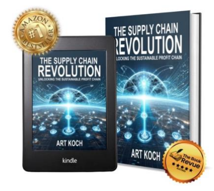
Find out more about "The Supply Chain Revolution" here.